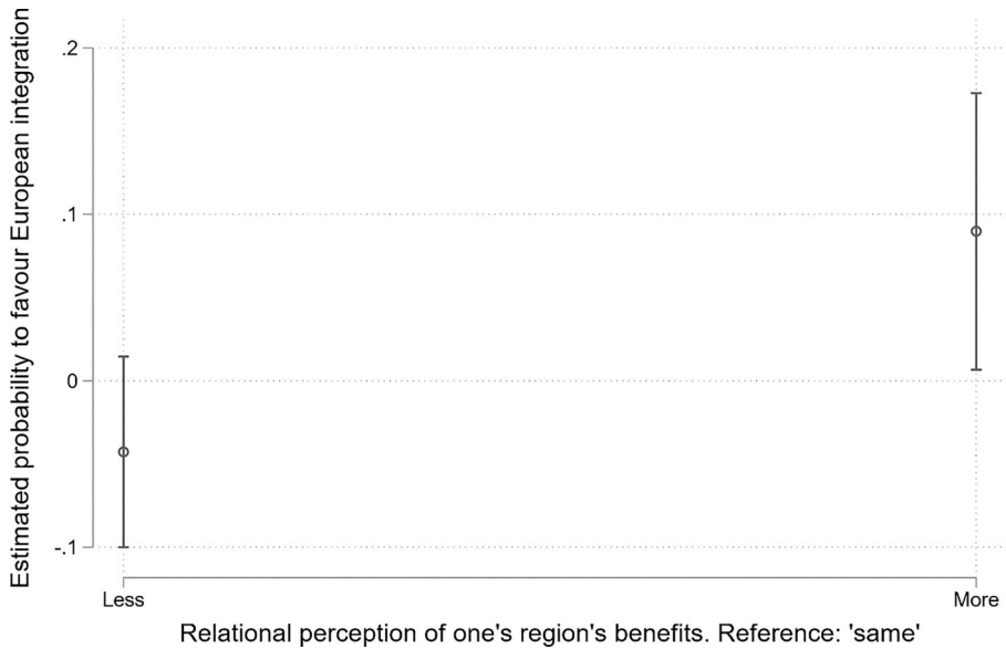
Fig. 3 Average marginal effects for respondents to favour European integration based on their relational perception that their region benefits more or less from European Union funding than other European regions. Estimates are based on model 8 in Tab. 5 in the appendix