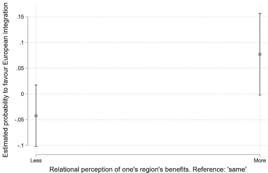
Fig. 4 Average marginal effects for respondents to favour European integration based on their relational perception that their region benefits more or less from European Union funding than other regions in their country. Estimates are based on model 10 in Tab. 5 in the appendix